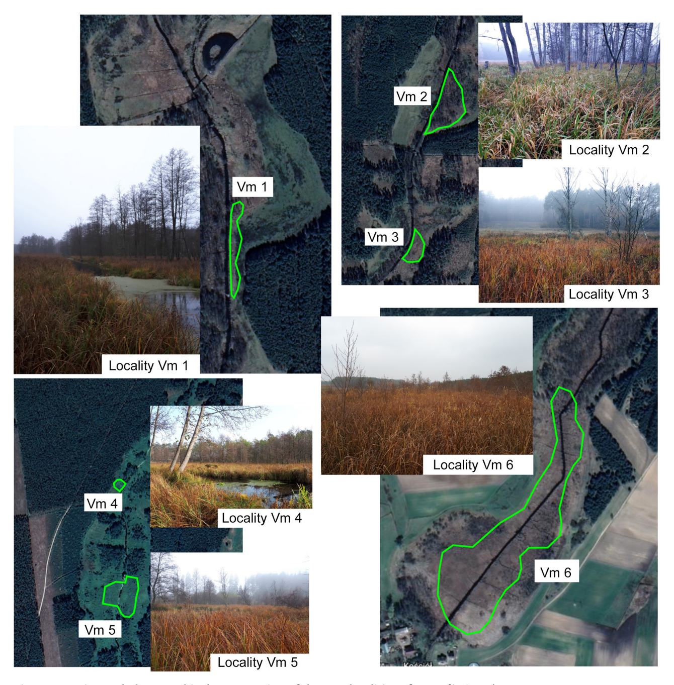
Fig. 3. Location and photographic documentation of the new localities of V. moulinsiana (Vm 1, Vm 2, Vm 3, Vm 4, Vm 5, Vm 6) at Skic (NW Poland). The boundaries of the sites are shown as green lines. Photo: November 9th, 2018 by ANNA LIPIŃSKA